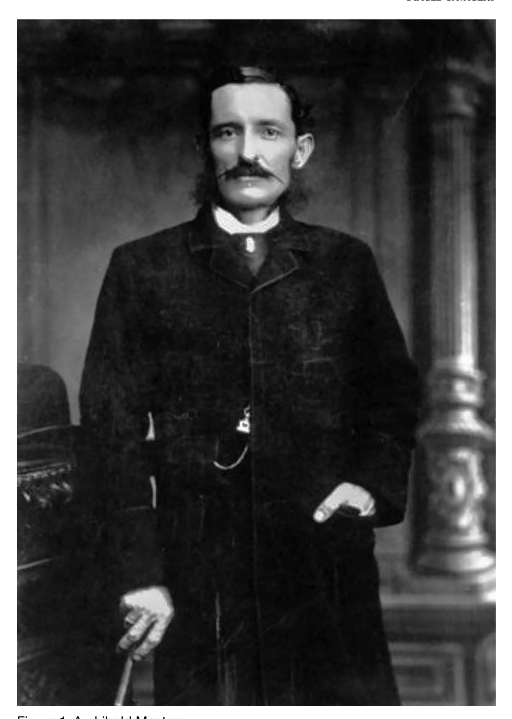
Figure 1: Archibald Meston.