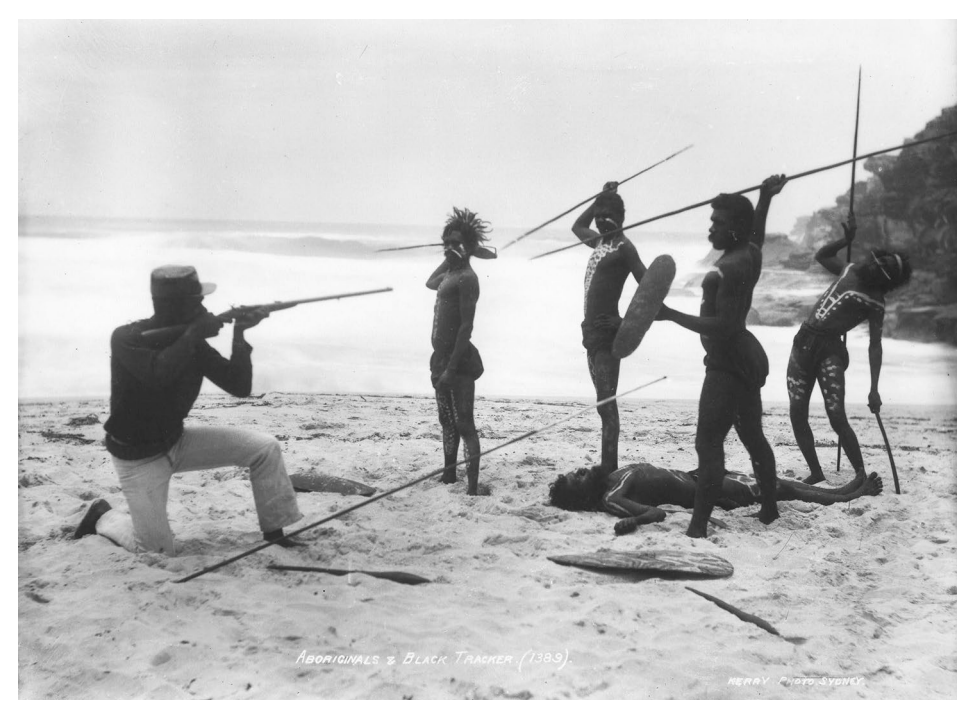
Figure 3: Wild Australia Show tableau of a native trooper 'dispersing' Aboriginal attackers; this was photographed in December 1892 on Sydney's Tamarama Beach near Bondi by Charles Kerry.

Source: Courtesy of Tyrrell Collection, Museum of Applied Arts and Sciences, Sydney.