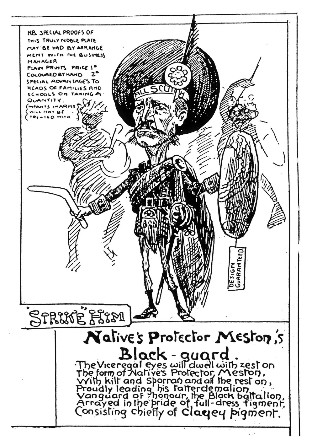
Figure 4: Meston and his warriors welcoming Lord Lamington to Brisbane.