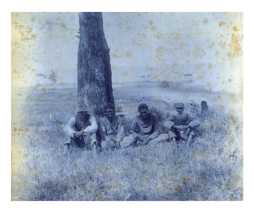
Figure 5. Digital scan, 2008. This digital scan shows how copying has cropped the image on the album page. It also shows the gradual deterioration of the source photograph. Loaned by the Bancroft family, Courtesy MBLHC Bancroft family collection MBPS-0006-229.

tops of a few letters of a handwritten caption below the print are visible, and this suggests that