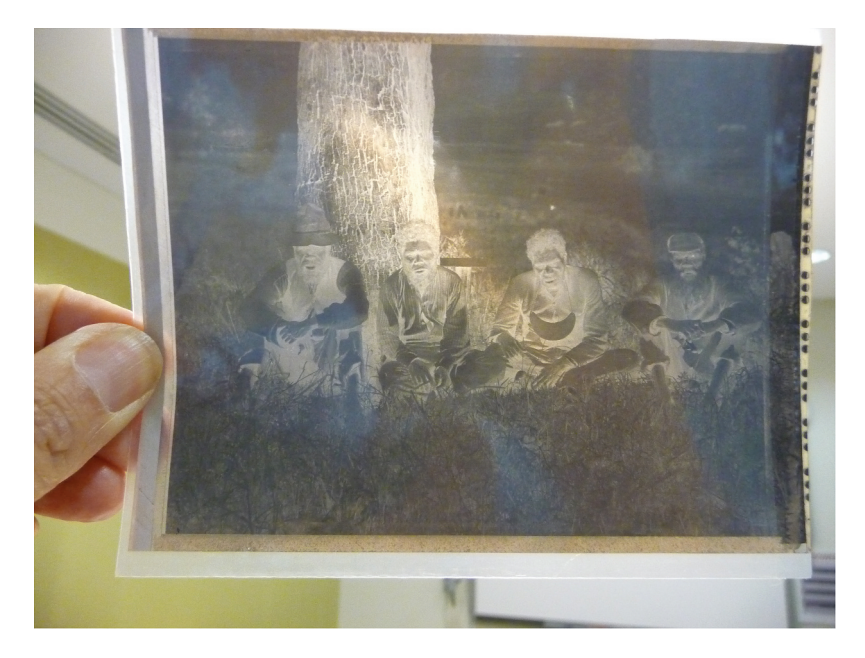
Figure 4. 6×7 cm copy negative, unknown date of creation.