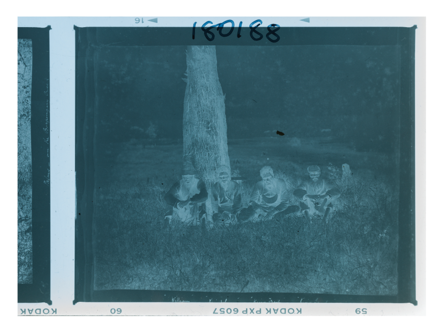
Figure 3. 6×7 cm copy negative, created in 1999. This negative shows the edges of the photograph and the top of the letters in the caption below the photograph. This indicates a caption exists but has not been photographically copied.